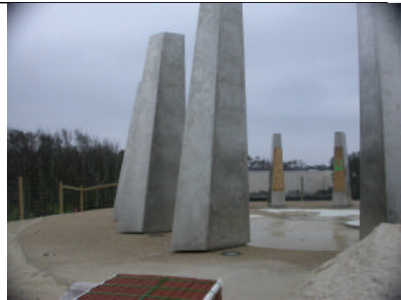
Coast Guard Pylon in Monument to A Century of Flight during construction at Kitty Hawk, N.C.

At this time of year many people consider the status of their itemized tax deductions. All contributions to the Foundation for Coast Guard History are tax deductible. This is a win-win opportunity. You pay less taxes, the Foundation gets funds to work with.