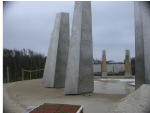
Coast Guard Pylon in Monument to A Century of Flight during construction at Kitty Hawk, N.C.

At this time of year many people consider the status of their itemized tax deductions. All contributions to the Foundation for Coast Guard History are tax deductible. This is a win-win opportunity. You pay less taxes, the Foundation gets funds to work with.